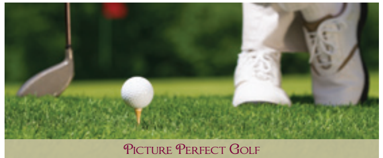
PICTURE PERFECT GOLF