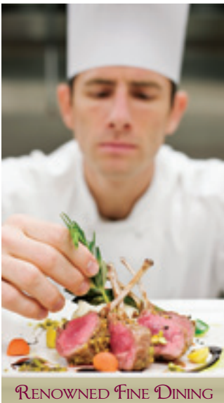
RENOWNED FINE DINING