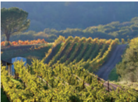
EXCLUSIVE WINERY TOURS AND TASTINGS

To demonstrate our commitment to earning a greater share of your universal life business, all UL sales will count DOUBLE towards qualification for the Ultimate Napa Getaway.