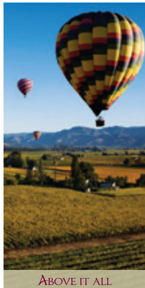
ABOVE IT ALL