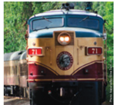
NAPA VALLEY WINE TRAIN